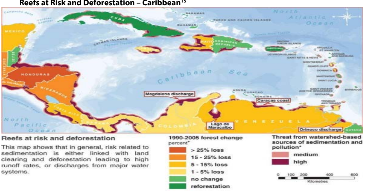
FIGURE 1 Reefs at Risk and Deforestation – Caribbean<sup>15</sup>

Farmers across the Caribbean are facing the direct and indirect effects of climate variability and change, although they may only recognise it as seasonal unpredictability and variability. Evidence gathered from the field indicates that smallholder farmers are the most vulnerable of the agricultural community precisely because they have had little help to secure their farms, natural resources and assets in the face of increasingly unpredictable weather and rising sea levels. The same farmers and fishers, however, have critical and yet unacknowledged roles to play in addressing climate change by changing their practices to use less energy and fewer inputs that produce intensive greenhouse gas emissions, and to care for and nurture biological diversity and the health of the soils. Because the science behind the interaction of climate change with ecosystems is only at a developmental stage, it is especially critical that human interactions with ecosystems are enabled to be organic and integral to adaptation. In other words, because there is no 'one size fits all' solution, it is especially important to ensure that the experiment of adapting to climate change is allowed to roll out.