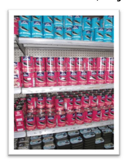
FIGURE 4 Grocery Store Shelves in St. John's, Antigua: Imported Fish

The tensions between small and large scale, between foreign and domestic investment, and between food and other crops are subject to intense power politics. While the region as a whole is a net food exporter, food price inflation has a detrimental impact on the nutrition, health and income of low-income populations. Rising food prices and differences in trade patterns create negative consequences even for those countries that are net food exporters. Between 2006 and 2008 the price of wheat increased by 152 per cent, and that of maize by 122 per cent, whereas the price of bananas rose by just 24 percent (Piñeiro et al., 2010). At the time of writing, Dominica had just reconfirmed its commitment to increasing banana exports.<sup>24</sup>